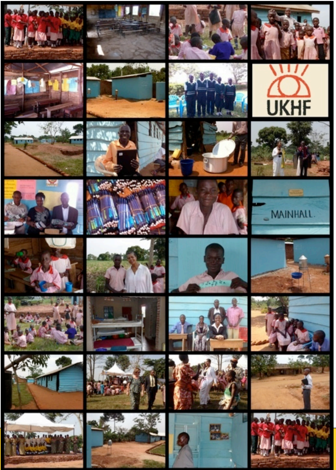
UKHF visit to Healing Children's School. 2014